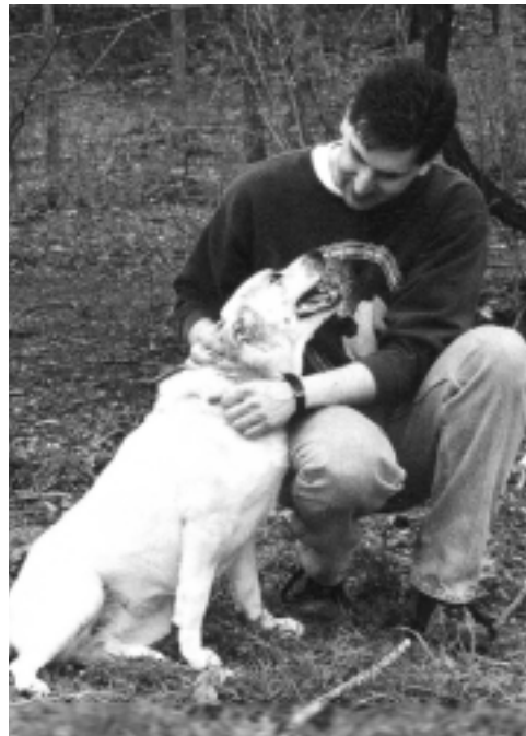
Sammy receives some special attention inside one of the memorial sanctuaries.

CARE works hard to find good homes for the animals. Volunteers and staff carefully screen each potential adopter to ensure that the home and the pet are a good match. We look for loving, caring and permanent homes. Volunteers also conduct checkups of the pets after adoption. We also have a take back policy. At CARE we prefer that our animals come back to us, instead of going to a shelter that might euthanize.